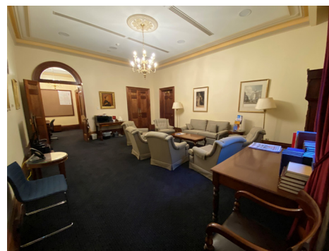
LOUNGE - LOOKING NORTH