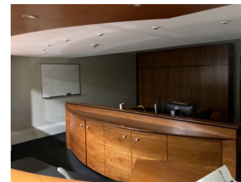
MEMBERS ADM. LOOKING NORTH WEST