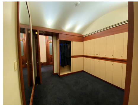
CLOAK - LOOKING NORTH EAST