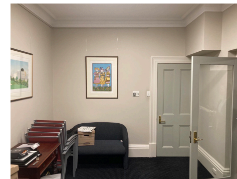
MEMBERS MEETING - LOOKING NORTH