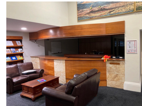
LOBBY - LOOKING WEST