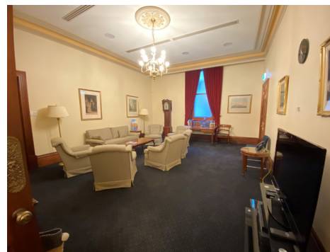
LOUNGE - LOOKING SOUTH